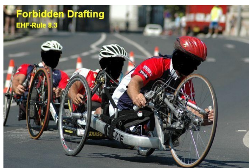
Pic 1: Two H2 riders directly behind one H4 rider