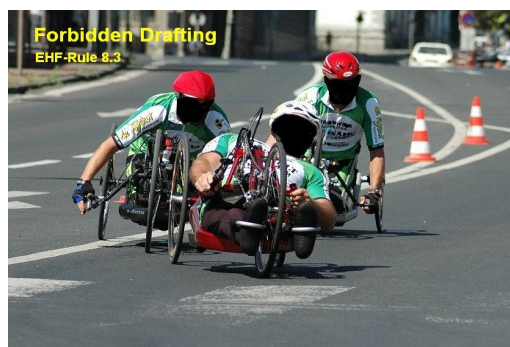
Pic 2: Two H4 riders behind one H2 rider